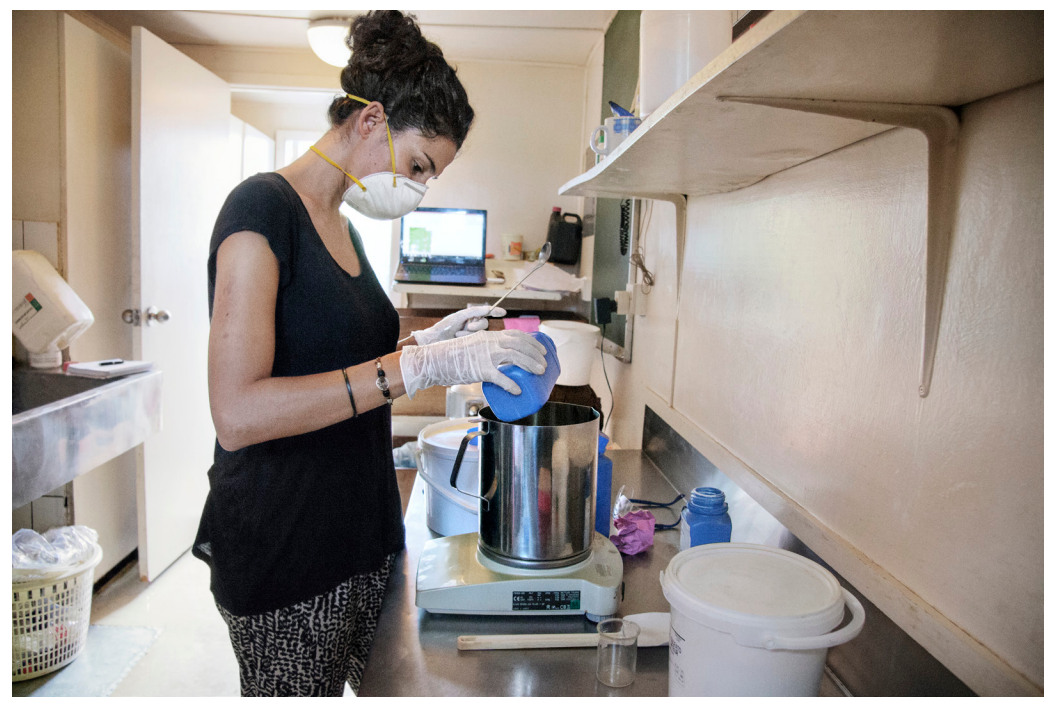
Until 2013, Kilisun was manufactured in a makeshift laboratory set up in a freight container, in quantities barely sufficient to provide sunscreen for two hundred people.

The team has also developed a training program in dermatologic surgery in the form of workshops. The workshops include a theoretical component in which the principles of skin cancer and possible therapeutic treatments are explained. These theoretical sessions are complemented by workshops in which dozens of patients with albinism are operated on. Local doctors participate actively in these operations, and over time acquire the necessary skills to carry out interventions without our help.<sup>7</sup>