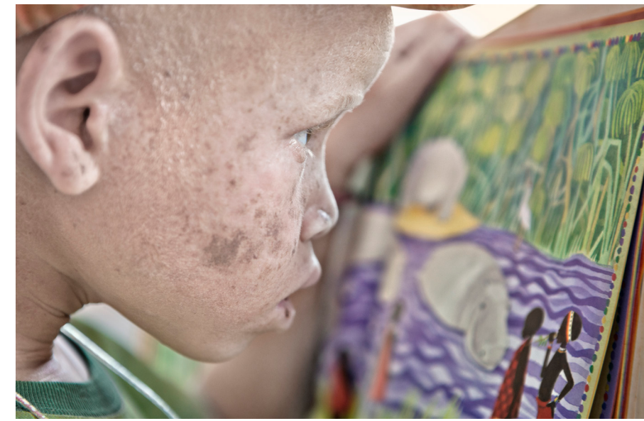
Without some other artificial protection (sunscreen, long-sleeved clothing, sunglasses, hats, etc.) from an early age albino children are very likely to suffer severe sunburn, which can lead to skin cancer, or the eye damage that will leave them totally blind. (above)

The Tanzania Albinism Society has registered eight thousand men,