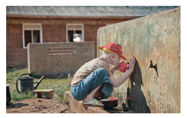
A child takes water from a communal fountain.

Many are thus deprived of access to a decent job. It is hard for them to find a partner, since their condition as "damned" beings scares others. Their own neighbors say that people with albinism do not die, they fade away, or that to touch one is to risk becoming white or falling ill. Living in such a social and cultural context is not conducive to self-esteem and some people with albinism experience the discrimination they are subjected to as natural.