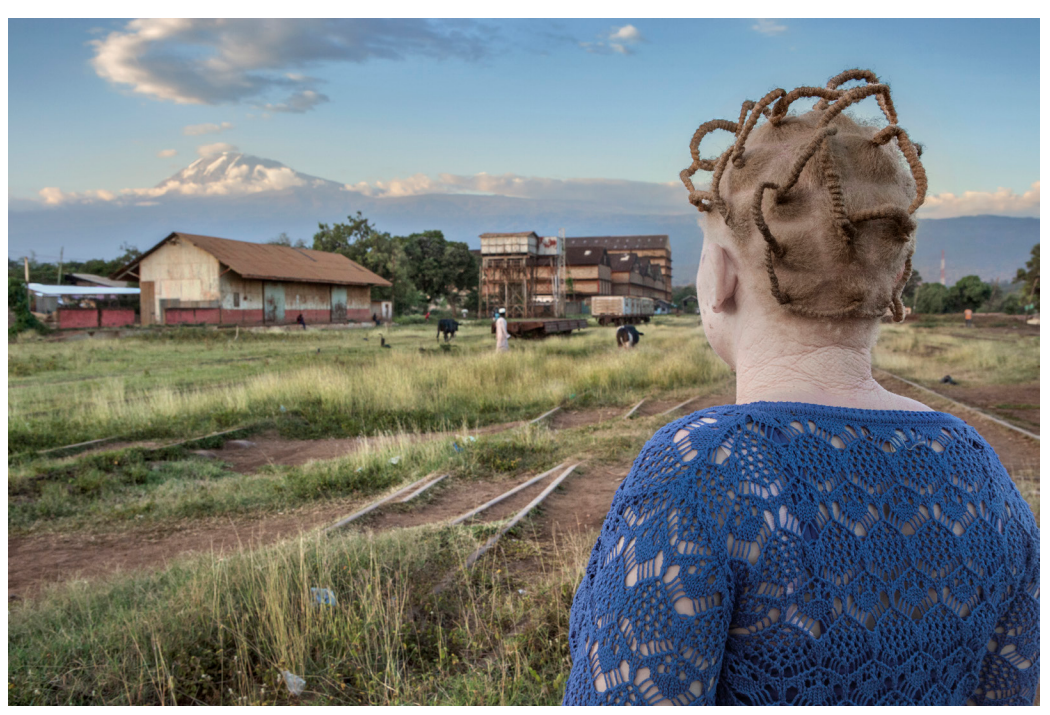
Kabanga. The Tanzanian government has found it necessary to set up special centers to protect people with albinism. Around a hundred albinos live at the Center.

Albinism, which seems so exotic in the West, is a deadly serious matter for those who suffer from it in Africa. It is a genetic condition consisting of a lack of pigmentation in the skin, eyes, and hair. It causes serious eyesight problems,