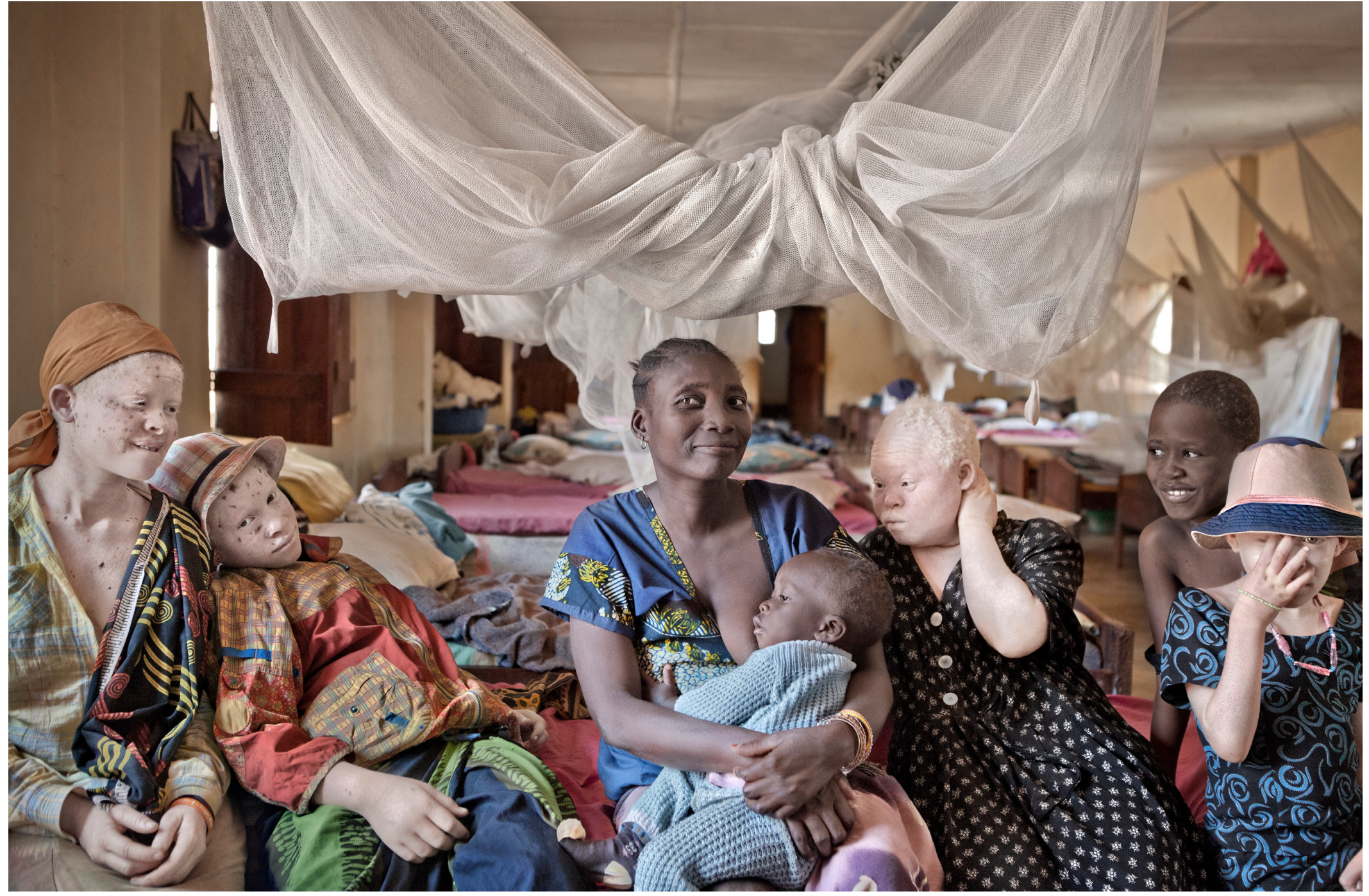
Children and a caregiver sit together in one of the dormitory rooms at Kabango.