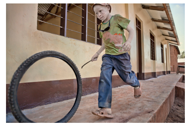
For a child a toy can be made out of anything. (top)