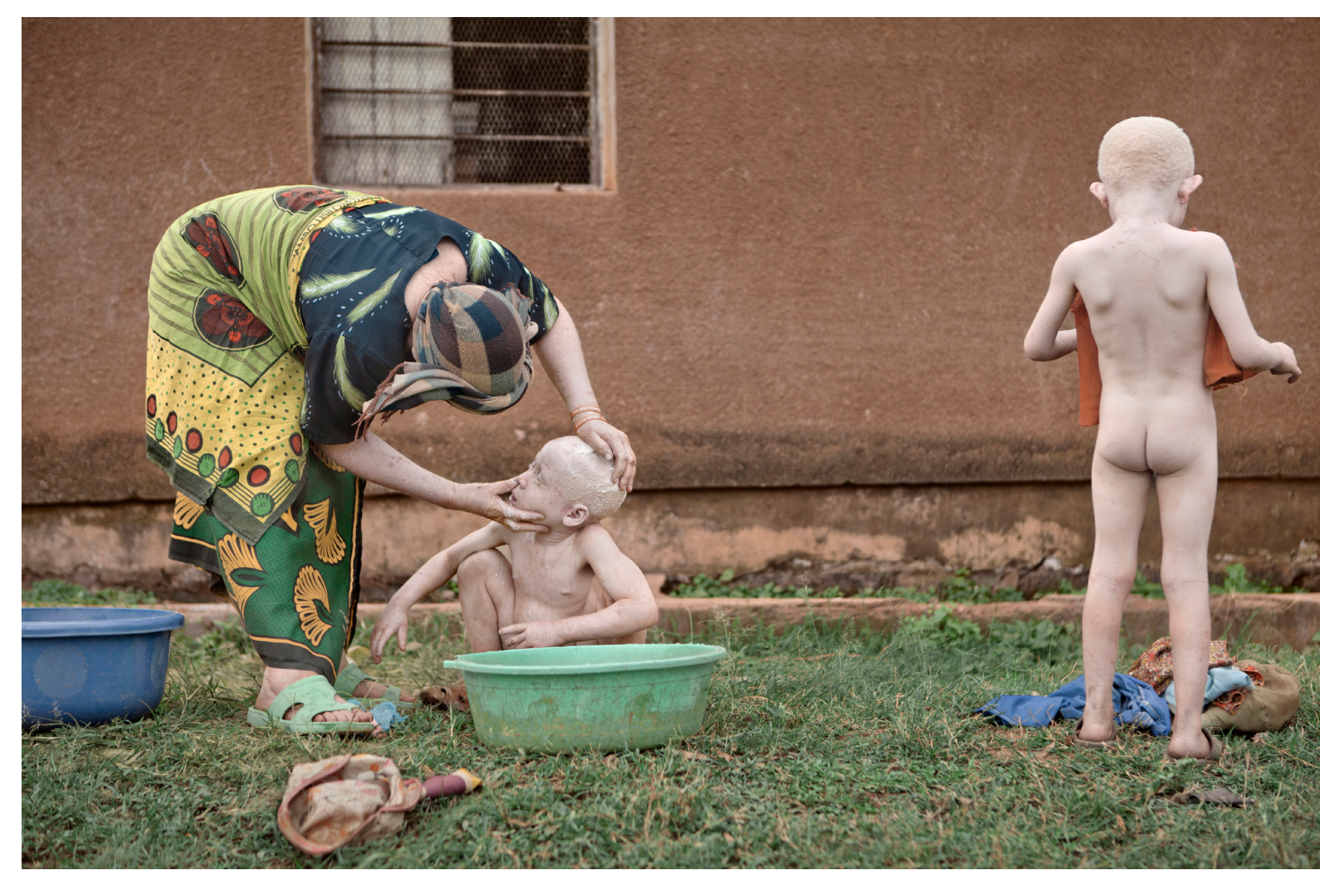
Bath time starts at sunset in Kabanga. This is the safest time of day when albino children can take their clothes off without being afraid of getting their skin sunburnt.