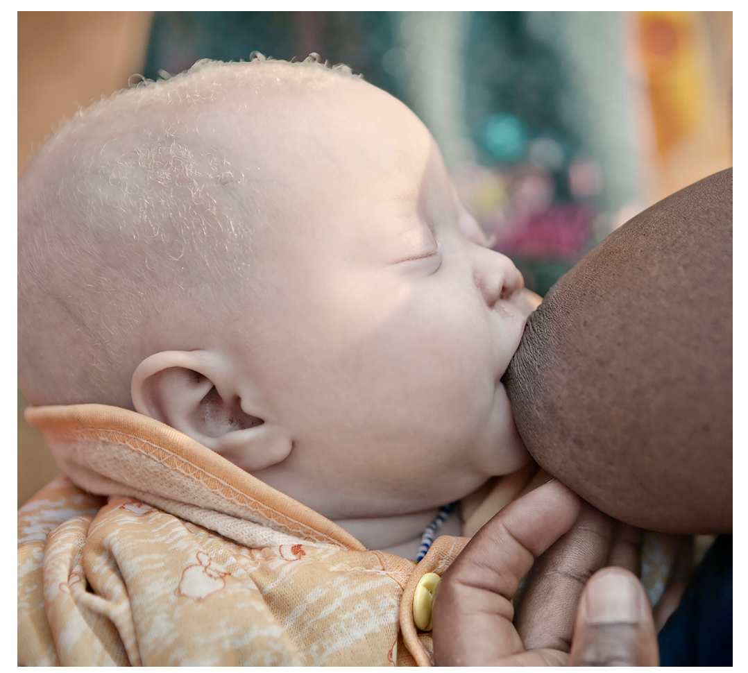
A mother nurses her child. Many women have to flee to complexes like Kabanga to seek protection when they give birth to an albino baby. The women who live at Kabanga take care of their own children and also act as "guardians" for other albino children who have been abandoned at the center.

This is just the first of a series of social disadvantages they will encounter in different stages of their life. Receiving little stimulus at home, they have difficulties in school because they can't see the blackboard properly, and most fail to reach secondary school.