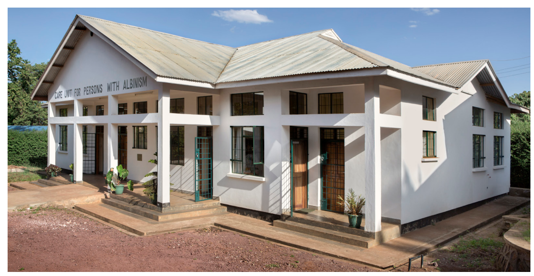
The Kilisun production laboratory, Kilimanjaro Sunscreen Production Unit, was opened in July 2013. In 2016 it distributes its products to two thousand three hundred people with albinism.

Getting a child to put on sun cream, and a hat and sunglasses every single day of his or her life is not easy. They may say they've put on cream when they haven't, the hats get lost, the glasses get broken. Like most children anywhere, children with albinism find the whole thing a nuisance. The difference is that for these kids, if they don't cover up they're likely to die before the age of thirty, which is the life expectancy of a person with albinism in Tanzania.