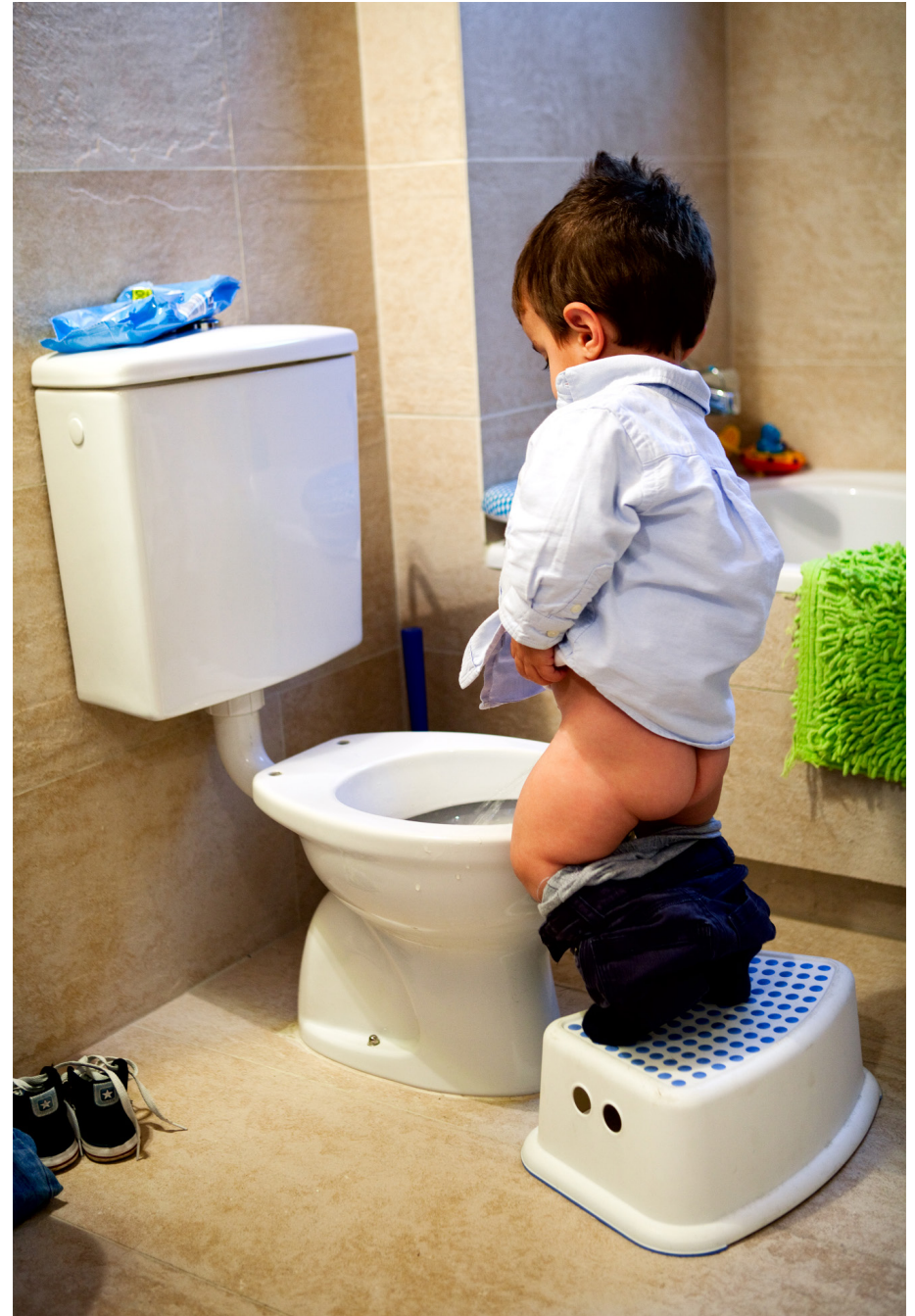
In his little adapted bathroom the difficulties of Ot's daily routine are clear. For adults or children, their stature hampers their everyday life.

His family is very supportive and tries to help him live a normal life. Their greatest challenge is to offer as much normality and strength as possible, while also setting an example of behavior in difficult situations.