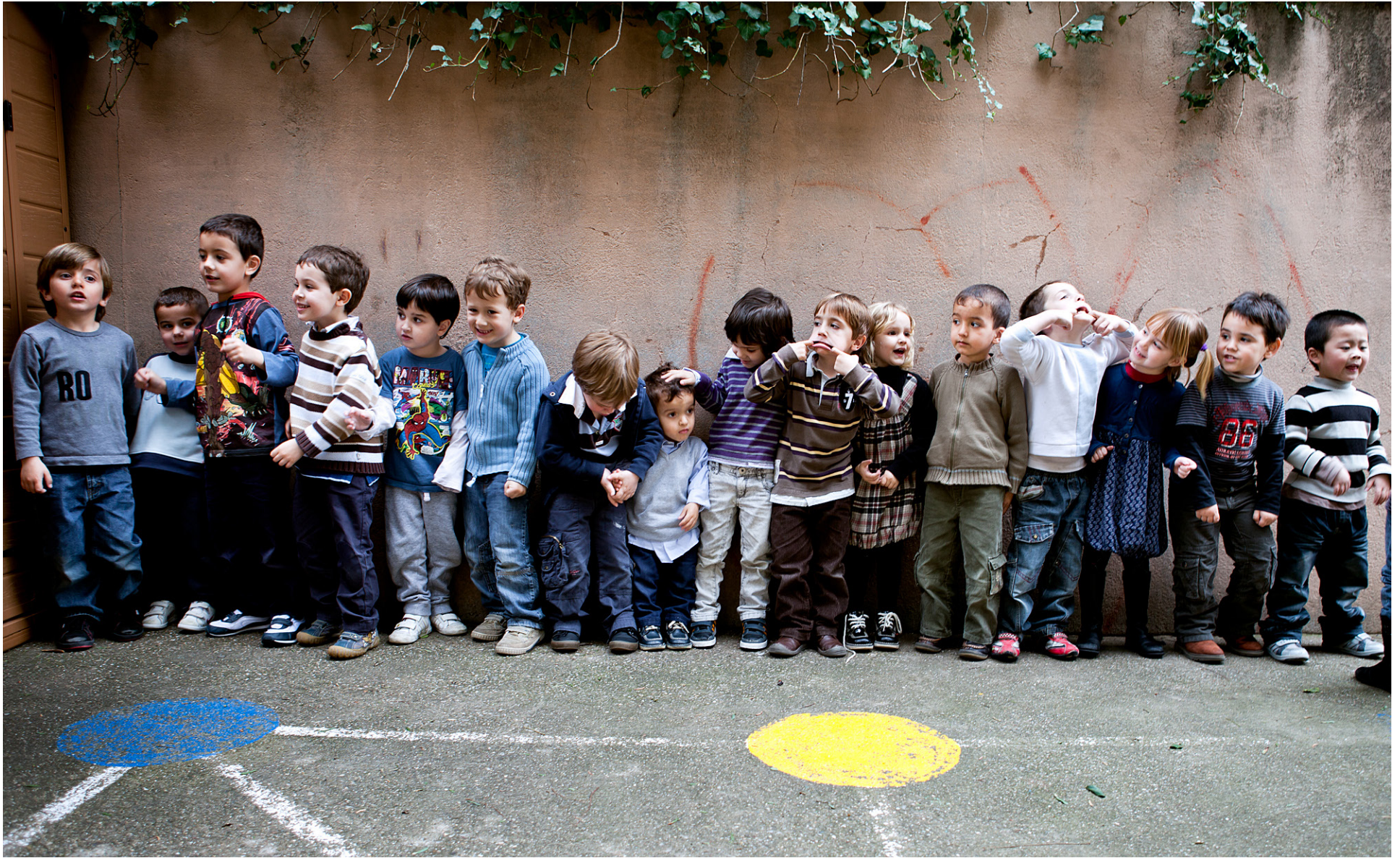
After recess, the children make a line. Here the difference in height is clear.