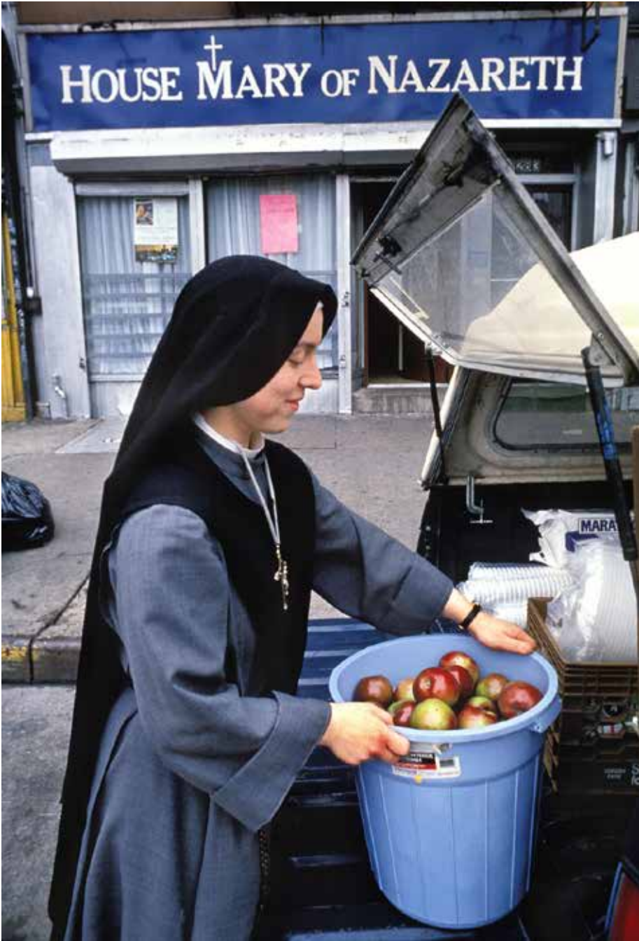
A Sister unloads apples for their soup kitchen.

Poverty is a fact of life in Spanish Harlem. It is one of the reasons the nuns chose to open a soup kitchen here. Every day they offer free meals to anyone who comes in. The kitchen feeds on average three-hundred people a day.