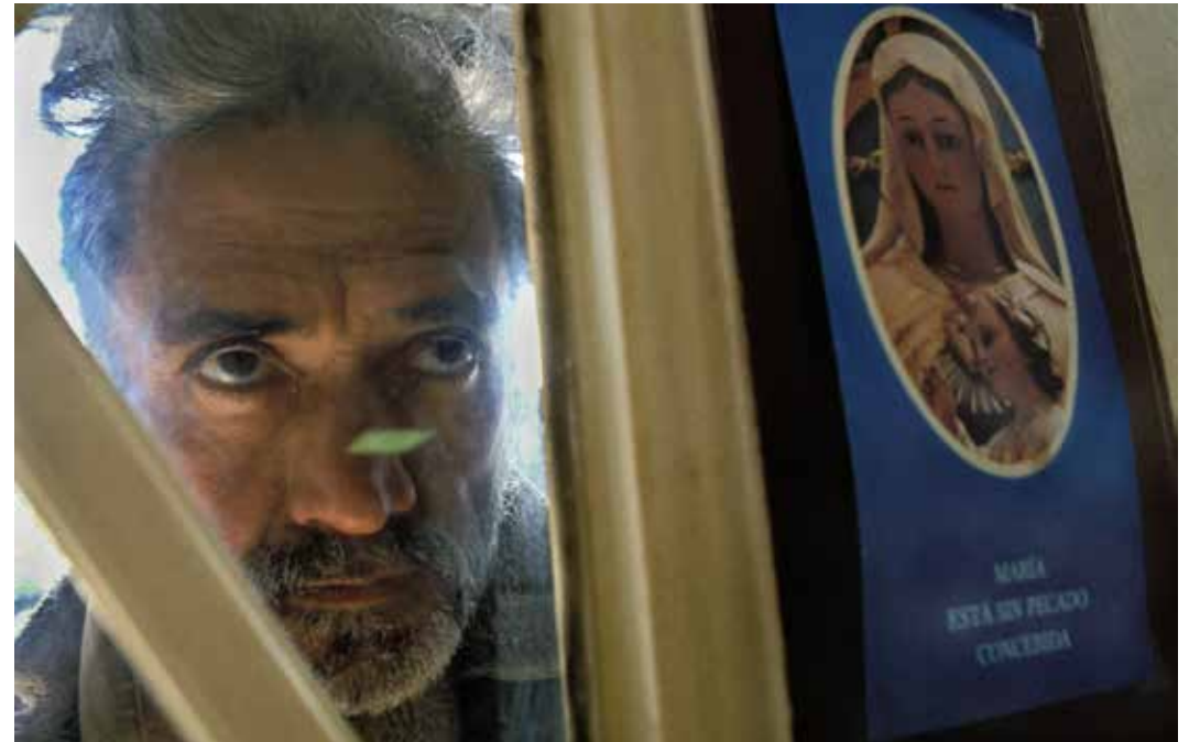
A man patiently waits at the front door for the kitchen to open.