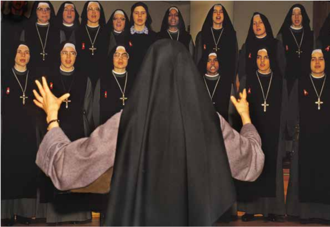
The choir begins. (top) Patients are wheeled into the hospital's auditorium to hear the nuns sing. (right)

The nun's larger order has a choir that performs for audiences around the world. They often visit hospitals and other facilities to perform for the sick and elderly. The music is rich and beautiful.