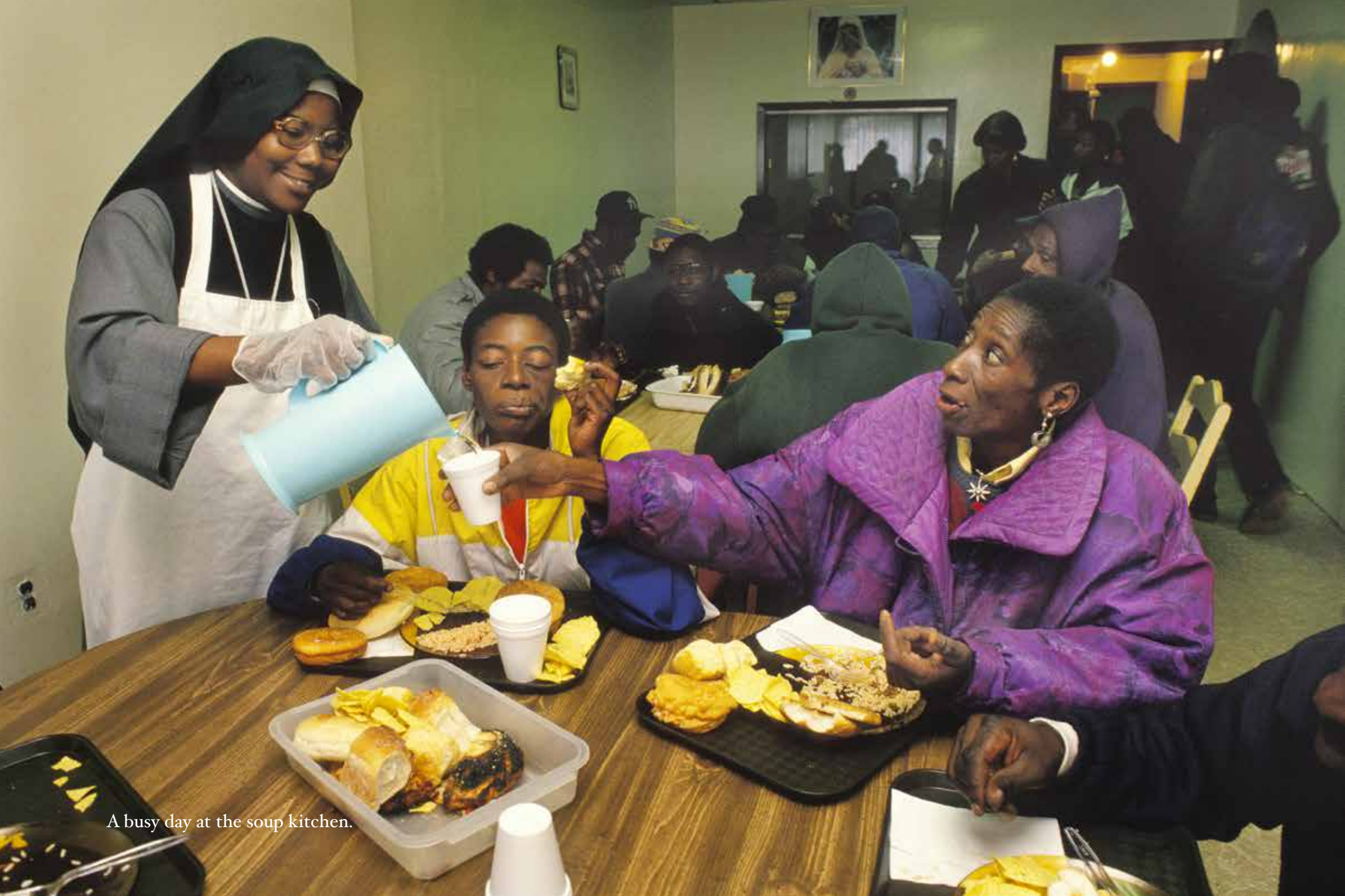
A busy day at the soup kitchen.